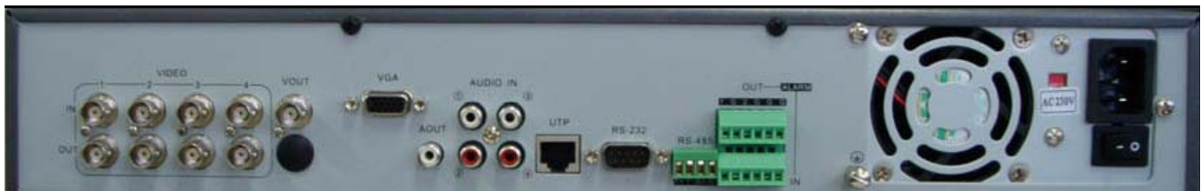
TT-DVR7004HE Rear Panel