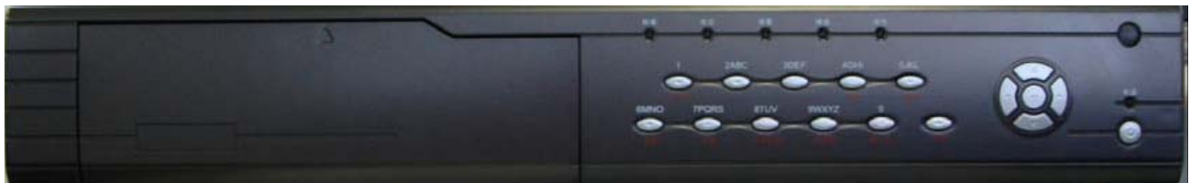
TT-DVR7008HE Front Panel