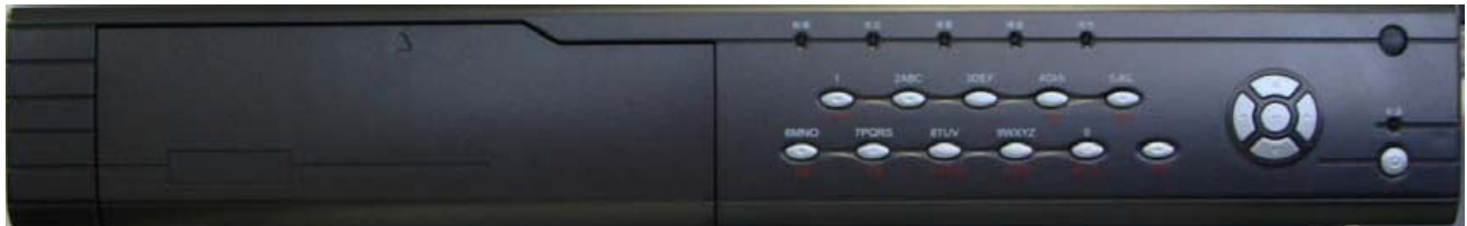
TT-DVR7000HE Series DVR Front Panel

TT-DVR7000HE series network digital video recorder is the 3 rd generation excellent digital surveillance product. It uses the Real Time OS and embedded MCU. It supports both features of digital videorecorder (DVR) and digital video server (DVS). It can work stand-alone or be used to build a powerful network, widely used in surveillance fields.